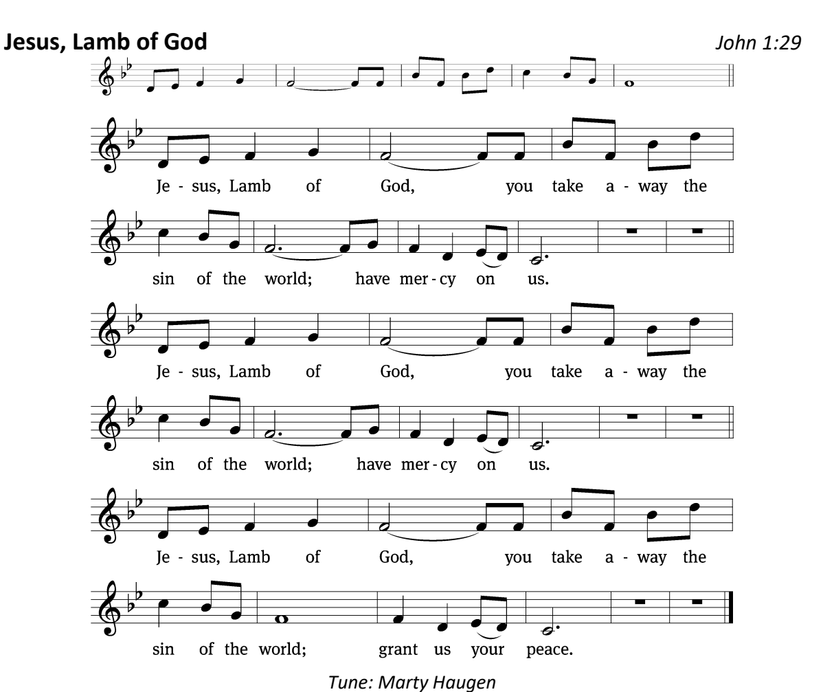
Tune: © 1984, 1985 GIA Publications, Inc. Used by permission: OneLicense no. 710931

The peace of the Lord be with you always. Amen.