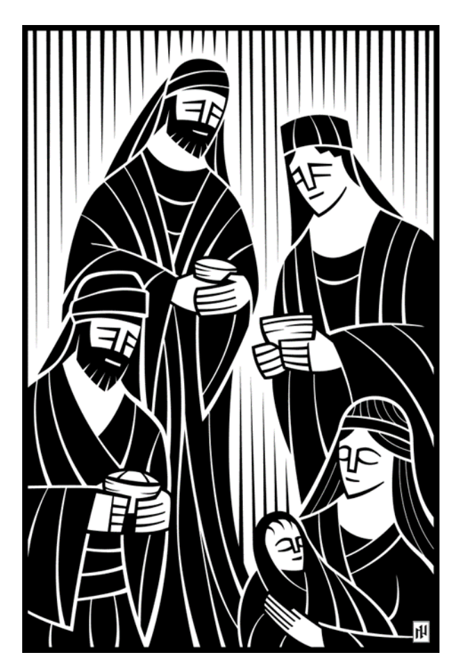
JESUS IS THE SAVIOR OF ALL PEOPLE

Epiphany Of Our Lord | January 4 & 7, 2024